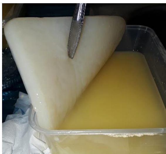
Figure 2. Nata de coco piña.