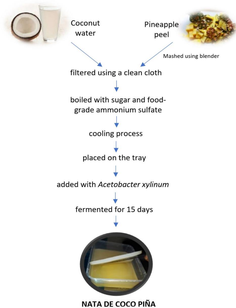
Figure 3. The flowchart of nata de coco piña processing.